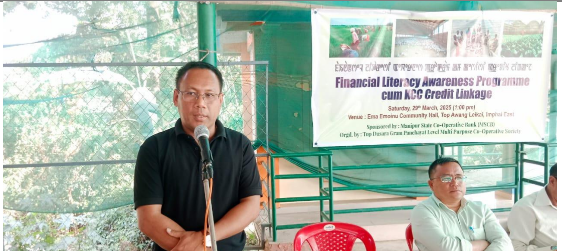
5. One day work shop on Financial Literacy Awareness programme cum KCC Credit Linkage at Imphal East District.