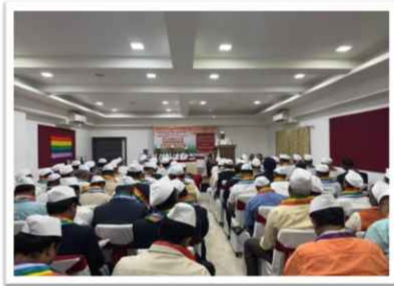
Seminar on Problems of Housing Societies by Maharashtra State Housing Federation Pune with District Deputy Registrar Pune (Pratinidhi Melawa) at Maval (16 February 2025)