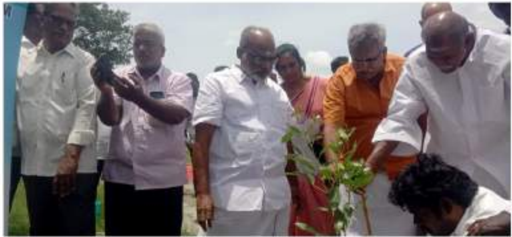
Honorable CM inaugurated the function for allotment of plots to the housing members by implementing the scheme Ek ped maa ke naam