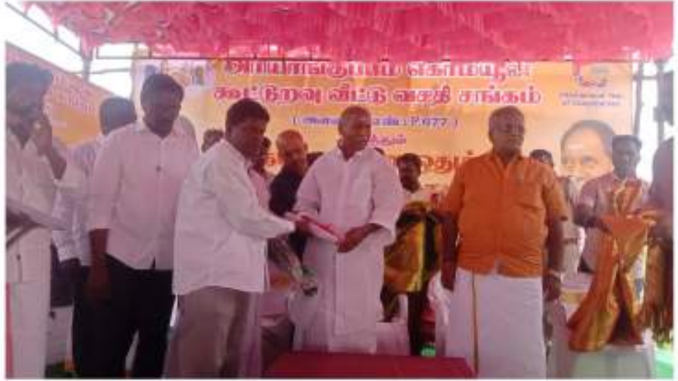
Allotment of Housing plots to the Members of Ariyankuppam Commune Co-operative Housing Society on 28.05.2025 by the Hon'ble Chief Minister, Puducherry.