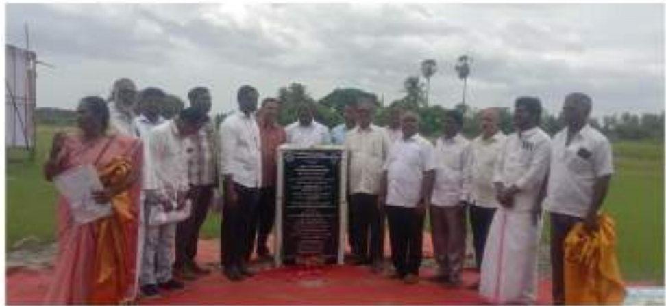
Allotment of Housing plots to the Members of Ariyankuppam Commune Co-operative Housing Society on 28.05.2025 by the Hon'ble Chief Minister, Puducherry.