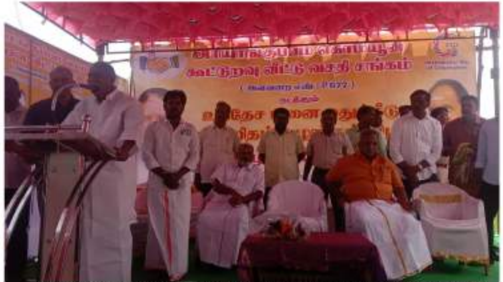
Allotment of Housing plots to the Members of Ariyankuppam Commune Co-operative Housing Society on 28.05.2025 by the Hon'ble Chief Minister, Puducherry.