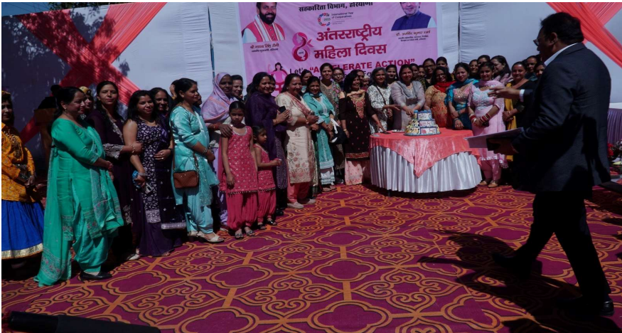
CELEBRATION AND SEMINAR IN PANCHKULA