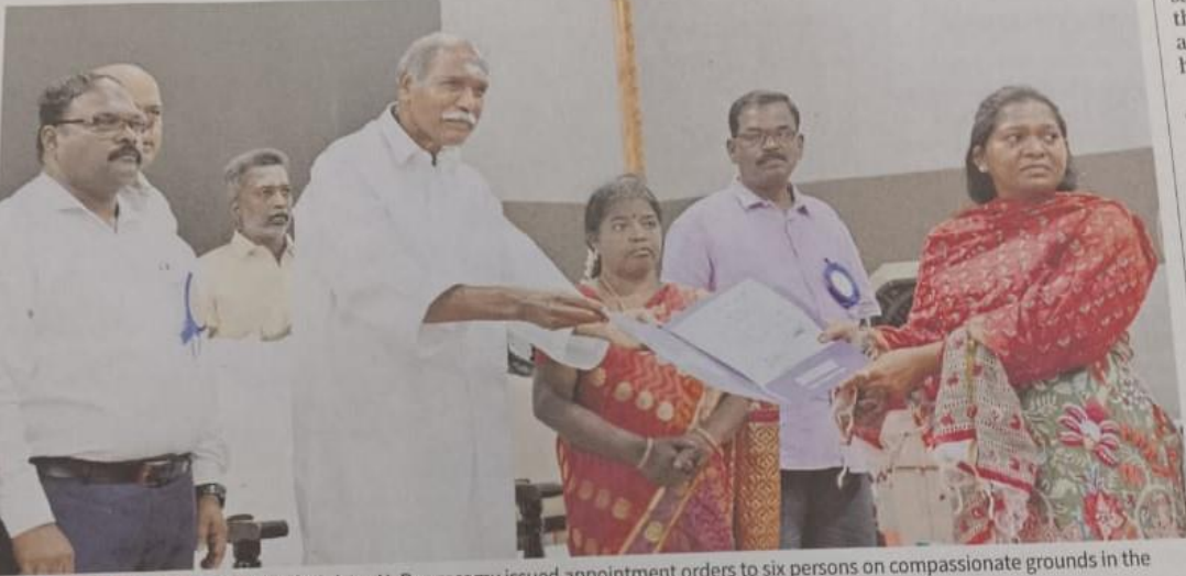
Step towards improvement: Chief Minister N. Rangasamy issued appointment orders to six persons on compassionate grounds in the Co-operative Milk Producers' Union in Puducherry, popularly known as Ponlait, on Monday.

CM N. Rangasamy said several measures are being taken to revive the cooperative sector in Union Territory, and handed over appointment letters to 31 junior inspectors in cooperative societies