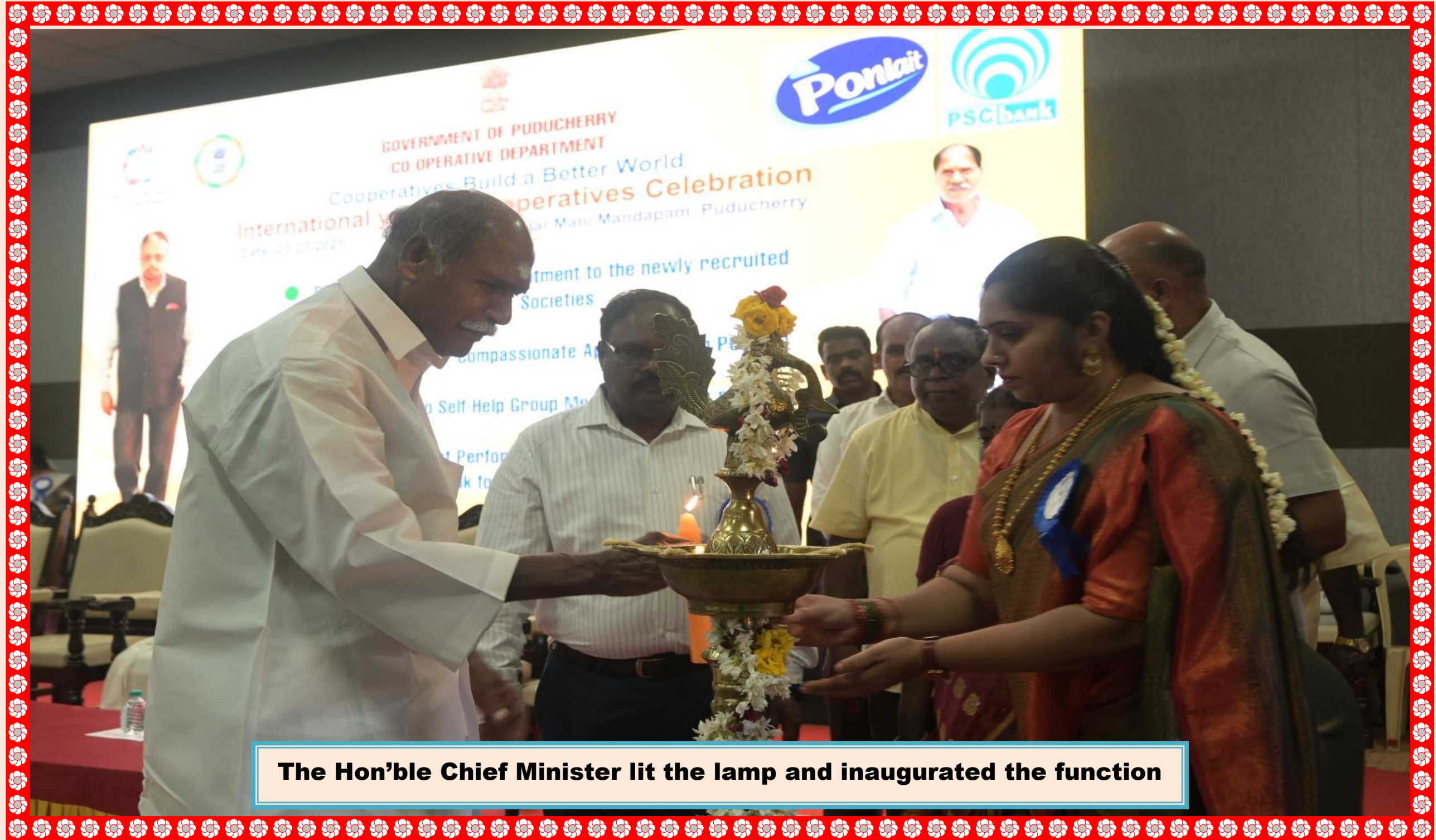
The Hon'ble Chief Minister lit the lamp and inaugurated the function