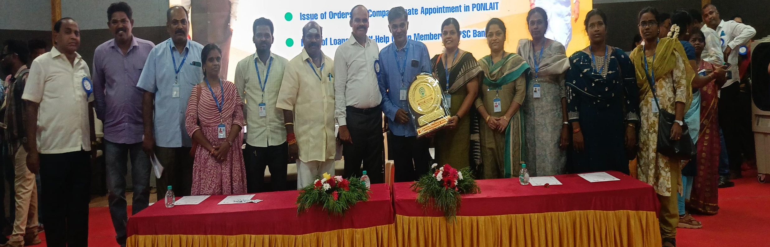
The Hon'ble Chief Minister presented the Best Performance Award to The Puducherry State Co-op Bank staff for their outstanding efforts in mobilizing deposits.