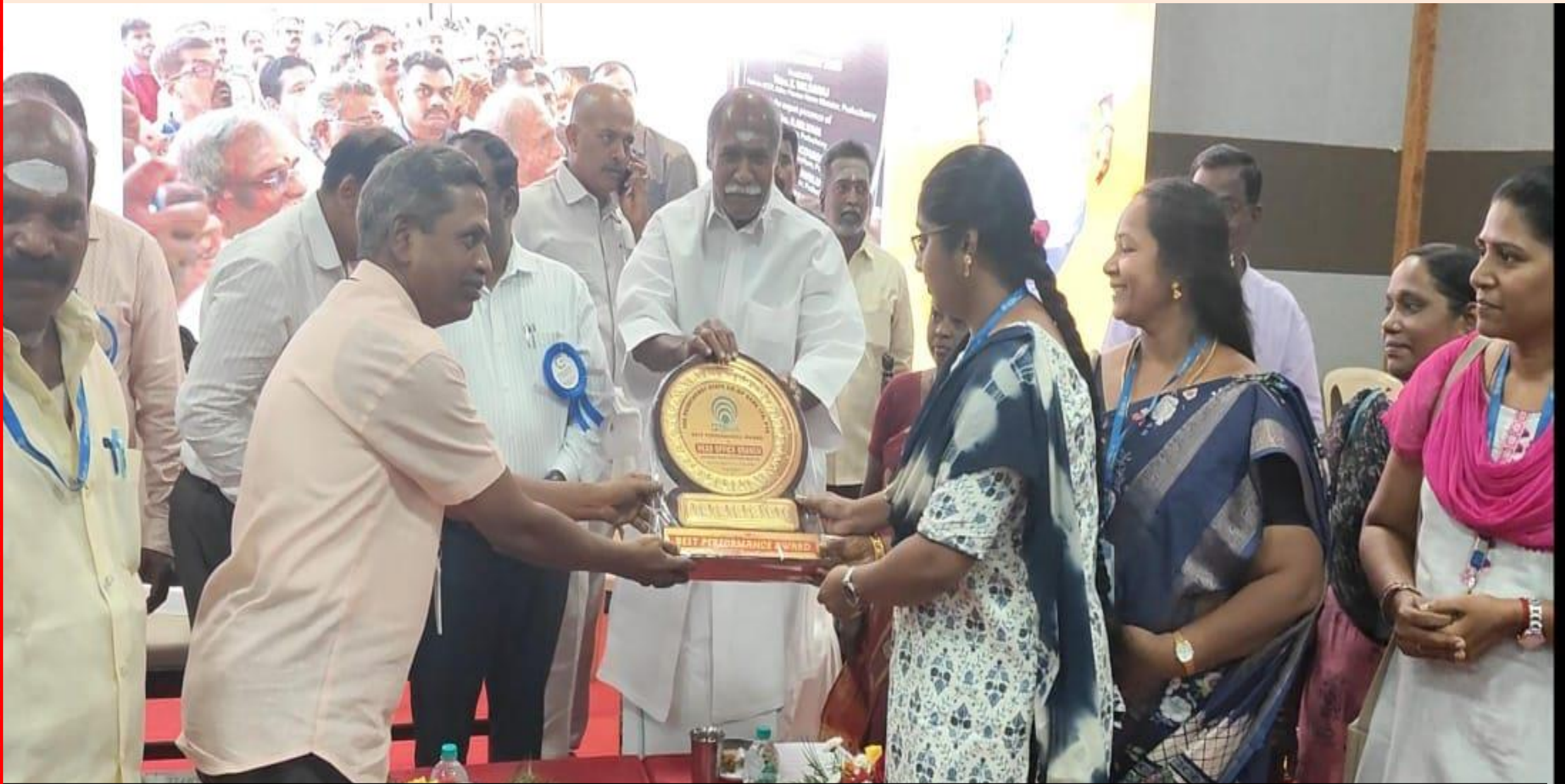
The Hon'ble Chief Minister presented the Best Performance Award to The Puducherry State Co-op Bank staff for their outstanding efforts in mobilizing deposits.