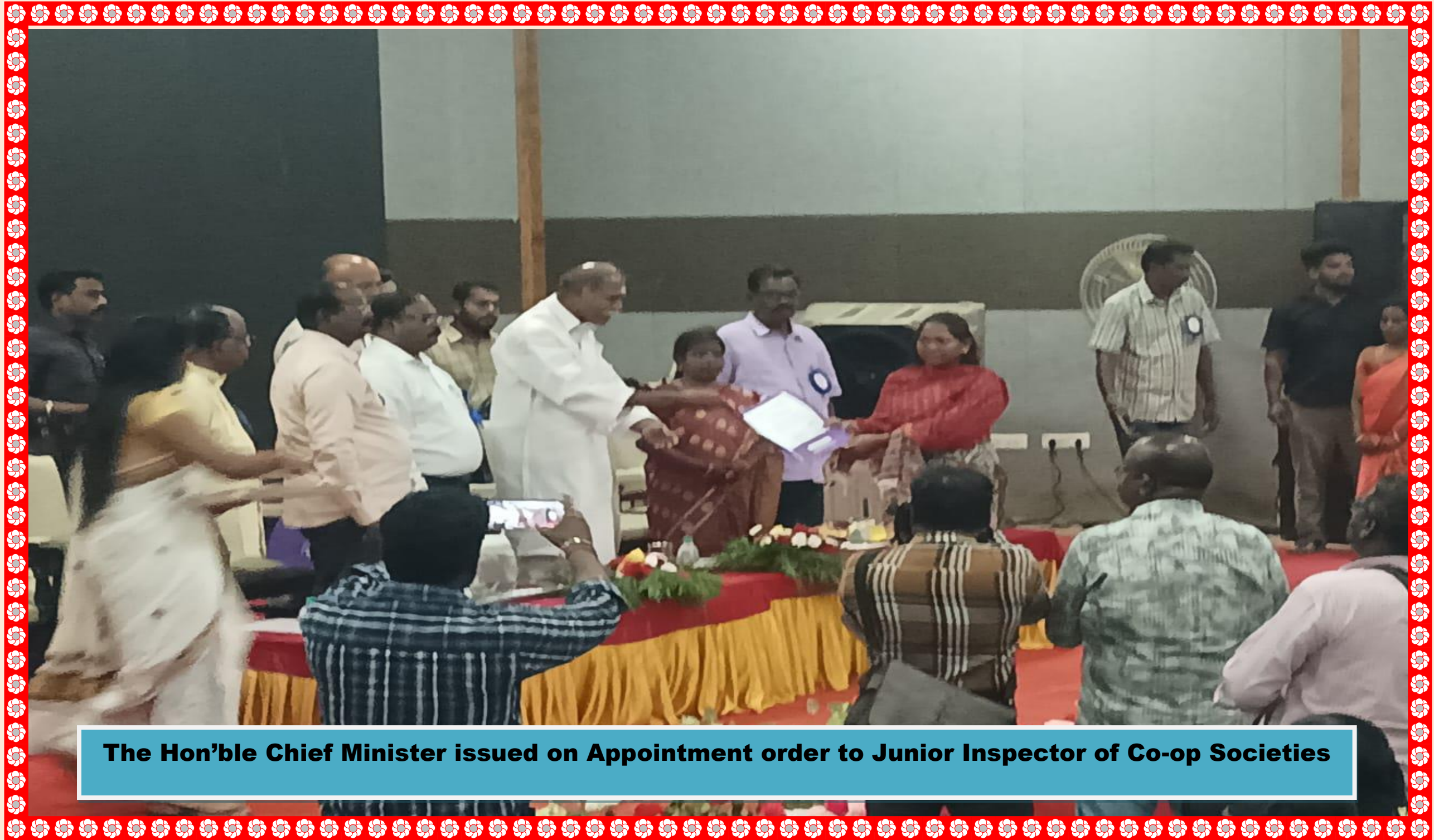
The Hon'ble Chief Minister issued on Appointment order to Junior Inspector of Co-op Societies