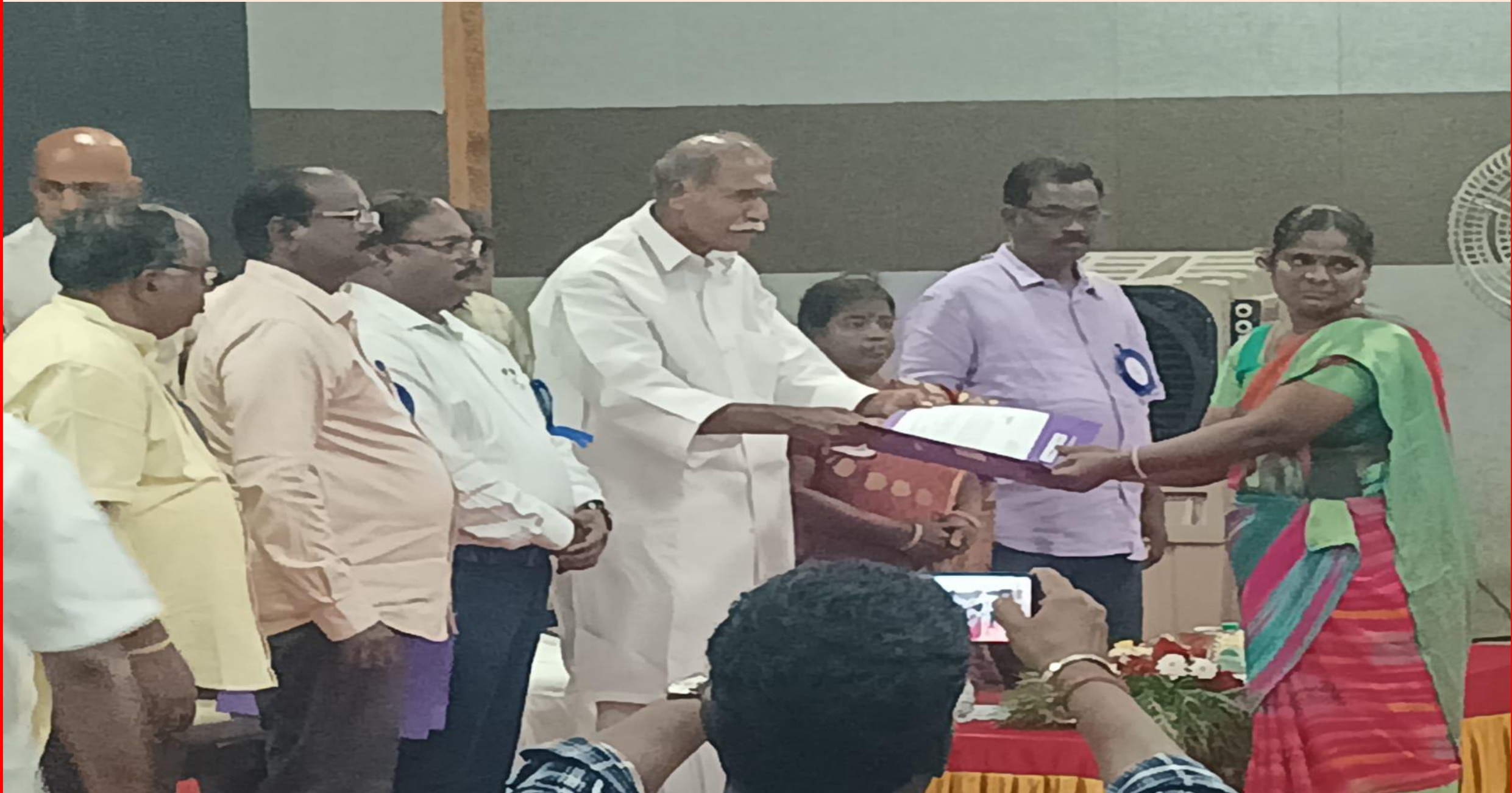
The Hon'ble Chief Minister issued an appointment order for compassionate grounds.