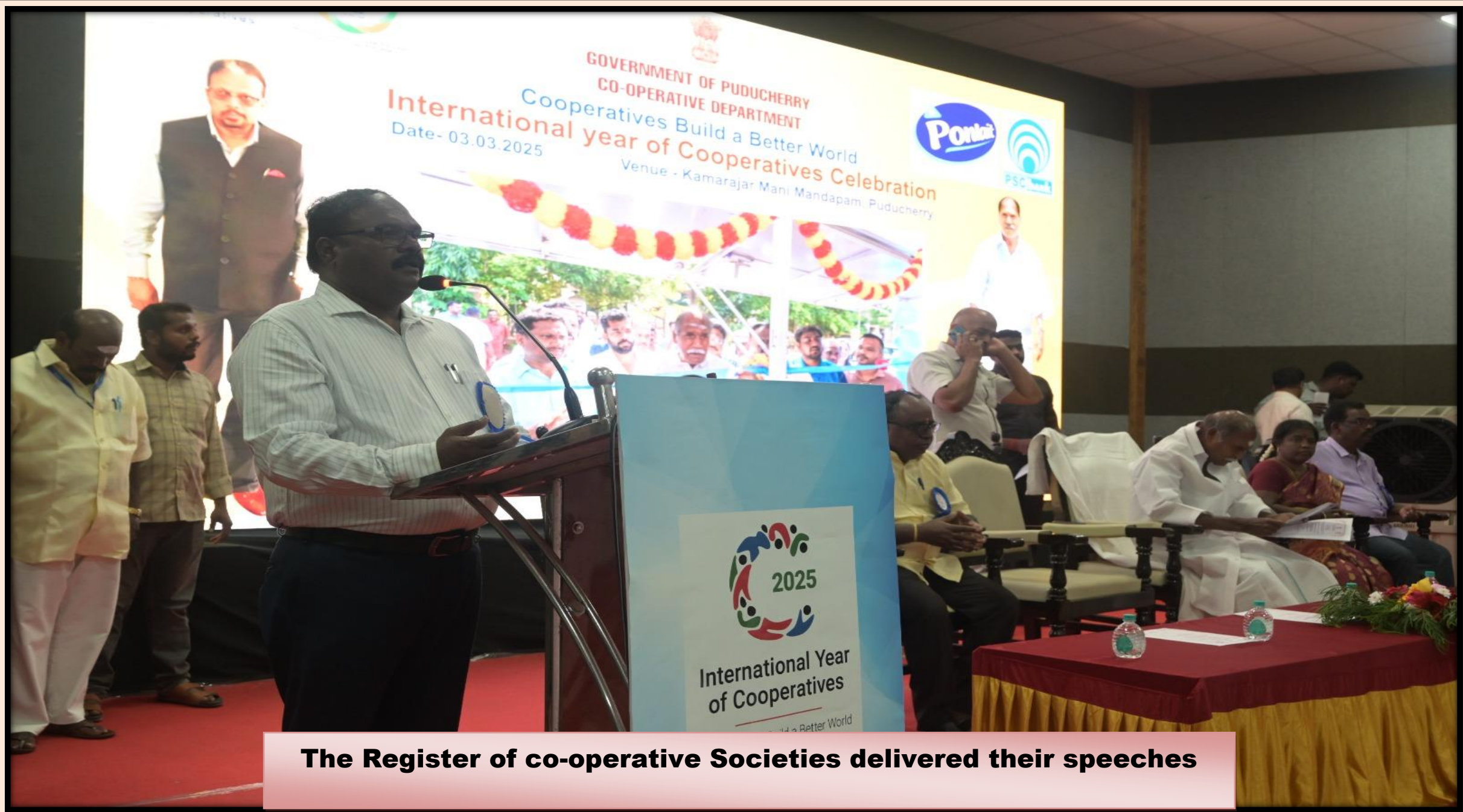
The Register of co-operative Societies delivered their speeches