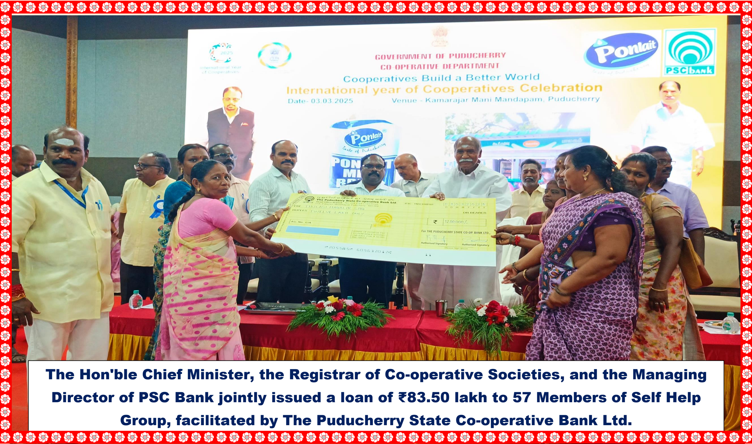
The Hon'ble Chief Minister, the Registrar of Co-operative Societies, and the Managing Director of PSC Bank jointly issued a loan of ₹83.50 lakh to 57 Members of Self Help Group, facilitated by The Puducherry State Co-operative Bank Ltd.