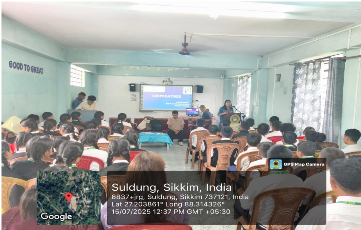
“ONE DAY AT SCHOOL” PROGRAM AT SORENG DISTRICT.