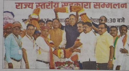
Chief Minister Vishnu Deo Sai and Assembly Speaker Dr Raman Singh being garlanded during the program at Balbir Singh Juneja Indoor Stadium in Raipur city on Wednesday.

Speaker of Chhattisgarh Legislative Assembly Dr Raman