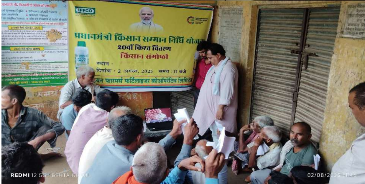
REDMI 12 5G BEHTA GOOD