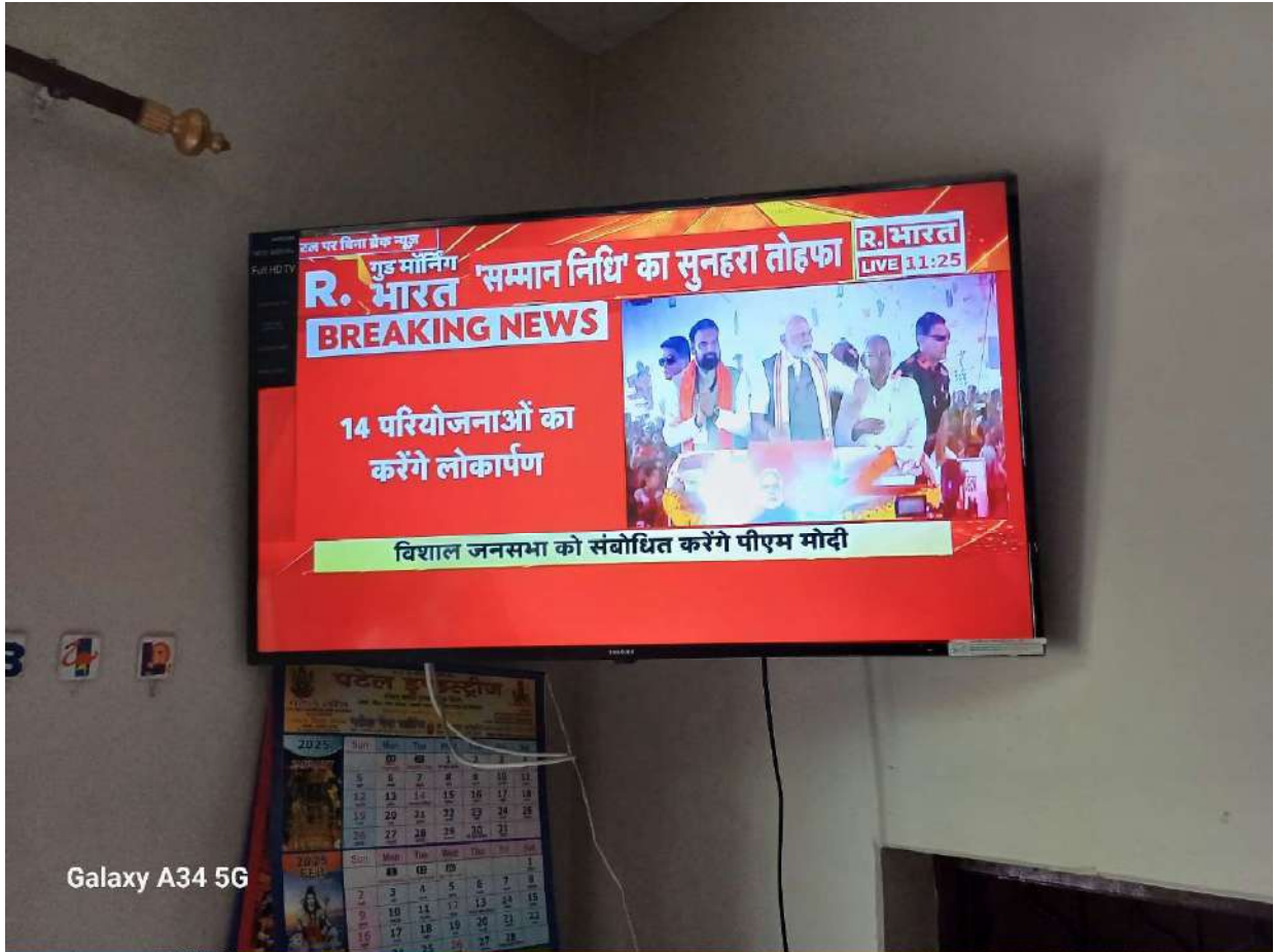
Galaxy A34 5G